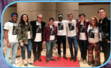
AuthentiCity //Oct. 4//

Bring your lawn chairs and enjoy a night of music under the stars!